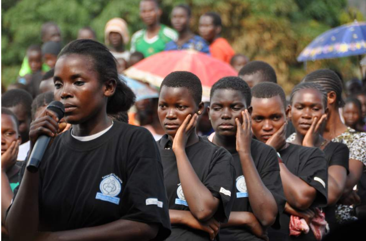
Women in Wampembe Village, Tanzania sing a song about maternal and child health at the opening of a new health center in 2015.