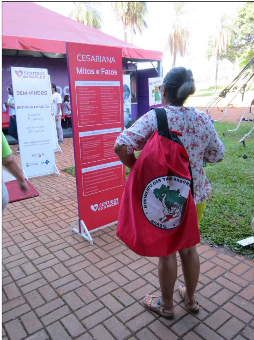
Woman from Brazil's Landless Workers' Movement reads "Myths and Facts" about cesarean section birth at the National Health Conference in Brasília, Brazil, December 2015.