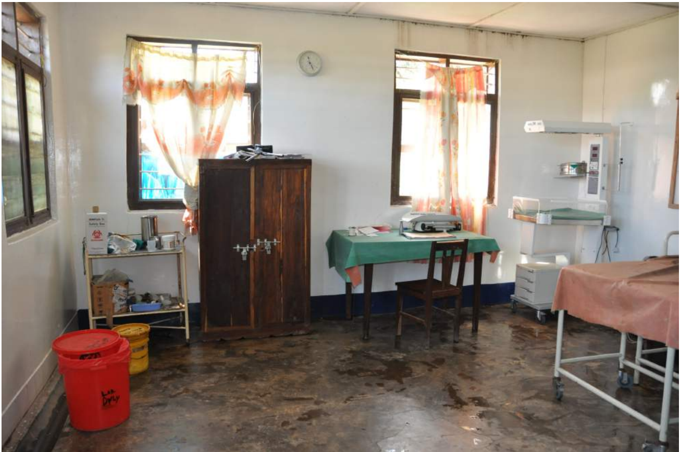
Labor and delivery room at Kirando Health Center in Tanzania which has received high marks for the quality of their care for pregnant women. April 2015.