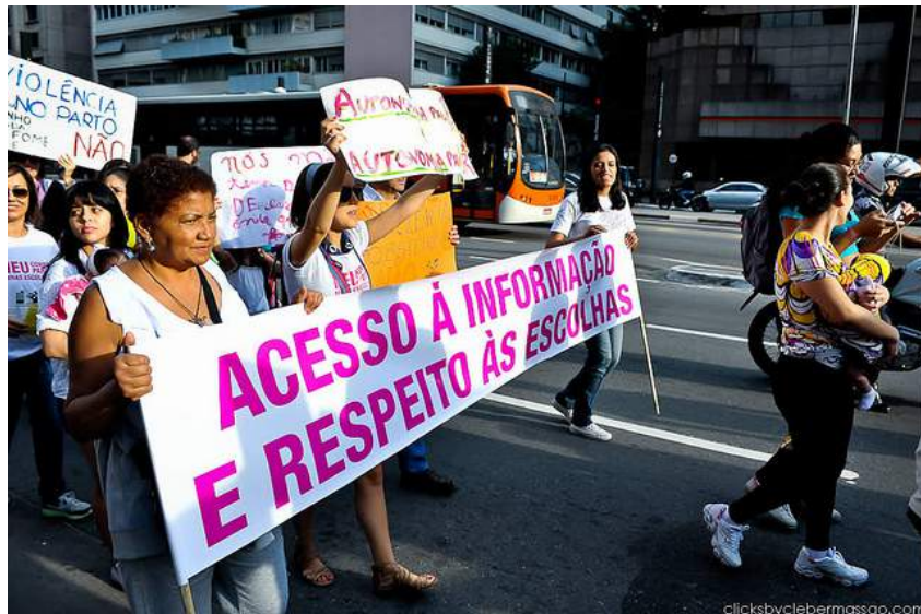
Rio de Janeiro – Brazil 2012 – Street demonstration. “Access to Information and Respect for Choices.”

activists and policymakers to campaign for human rights in reproduction and reform the over-medicalized model. In the following decade, more and more independent groups of women started to advocate for women's reproductive rights and to change maternity care in Brazil. Social media as well as street