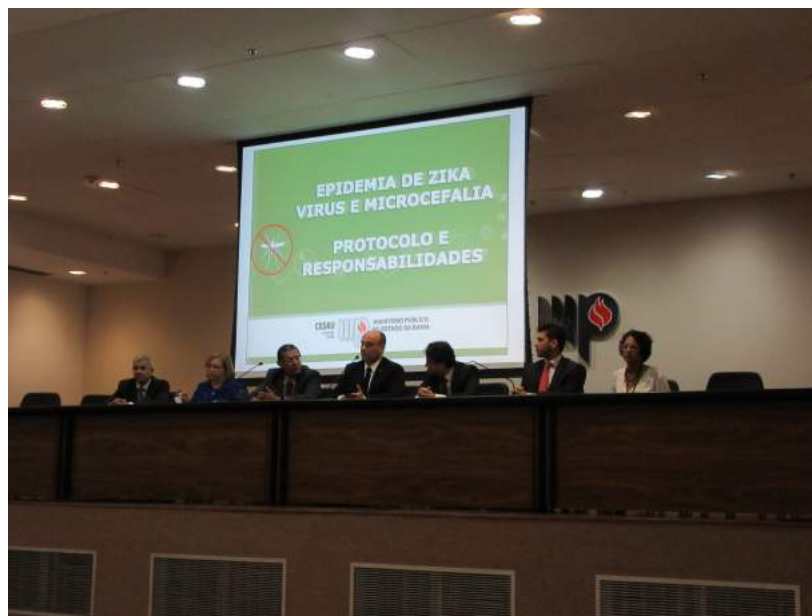
Local political leaders and public health experts discuss responsibilities during the Zika virus outbreak. Bahia, Brazil 2016.

Women become the targets of blame when they do become pregnant. How could