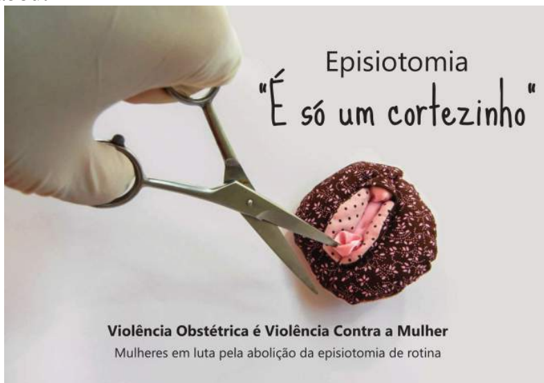
Information provided for users about episiotomy. “Episiotomy ‘Is just a little cut’” // “Obstetric Violence is Violence Against Women. Women fighting for the abolition of routine episiotomy.” ( Public domain )

The UK, despite its continuous history of midwifery, with strong, freely accessible community midwifery service from 1930s-1950s, has experienced some comparable challenges. The Government policy from the 1970s of universal hospital birth, which was grounded on misinterpretation of routine statistics and sustained by an era in which hospital care was seen as representing modernity and human rights to care, was replaced with ‘consumer choice’ policy from the 1990s. In 2005, in response to the limited evidence to underpin policy, the UK Department of Health commissioned a research Programme on the safety, quality and cost of different planned places of birth for ‘low-risk’ women in England. This included a large cohort study that compared outcomes for women and babies in different settings ( Birthplace Collaborative Group 2011 ) and ethnographic case studies of how care is provided across diverse settings, which it was anticipated would help