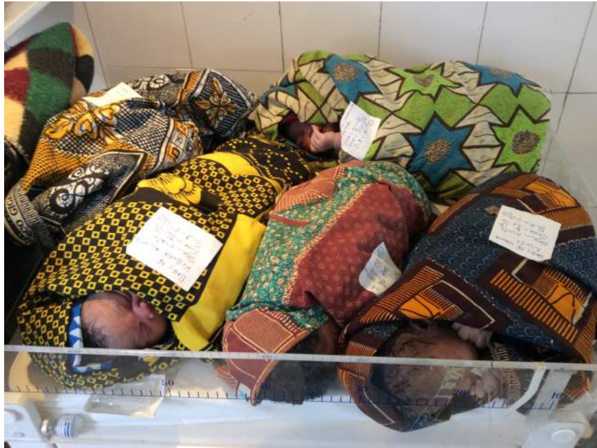
Babies delivered via C-section waiting for their moms to wake up from anesthesia. Sumabwanga, Tanzania 2014.